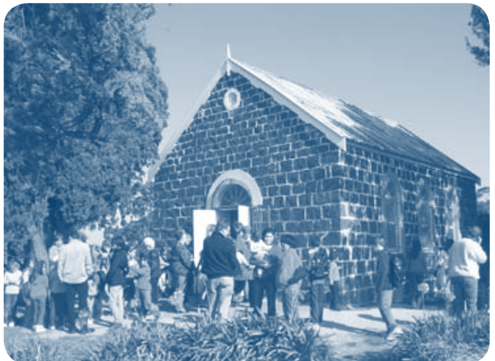
School children visit the church at Westgarthtown